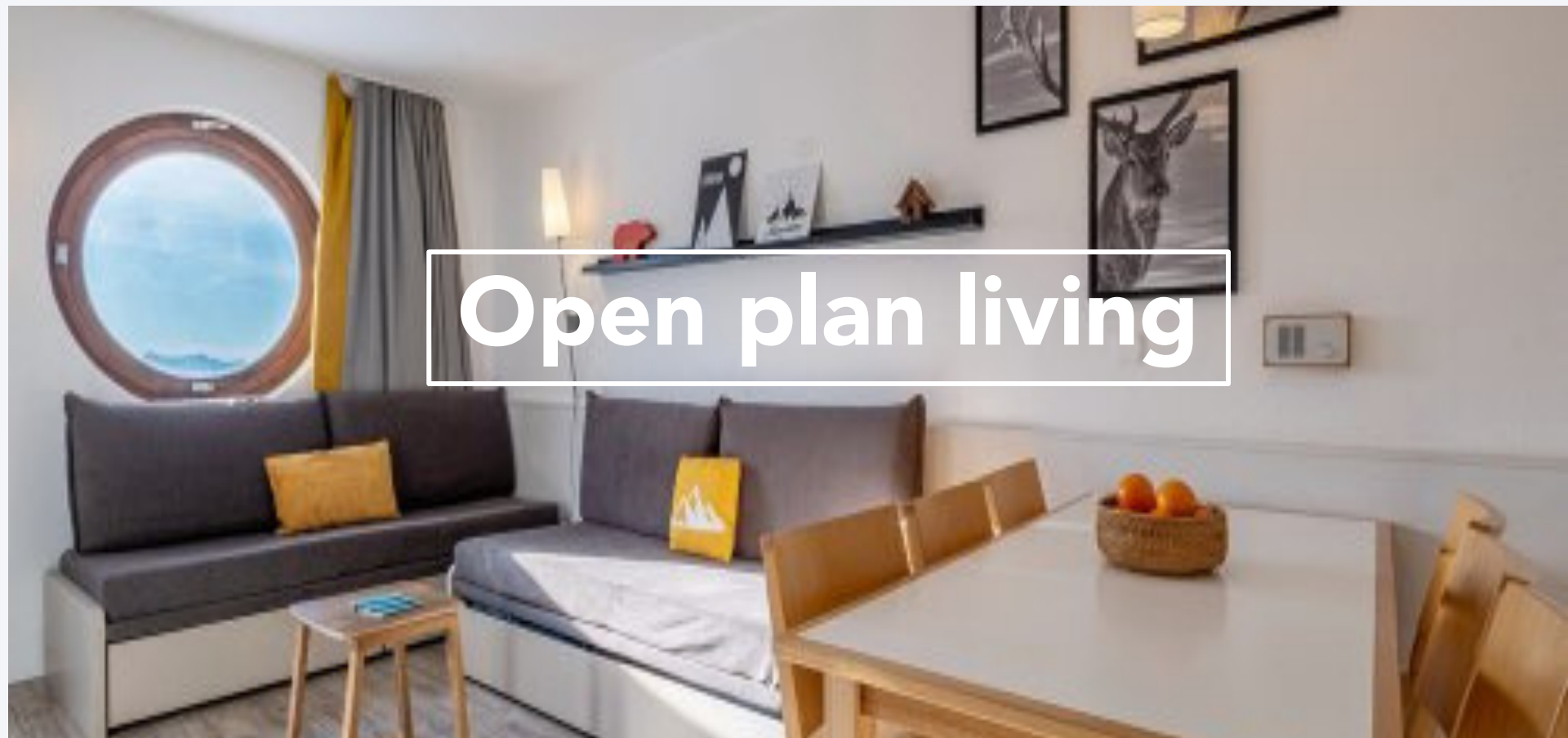
Open plan living