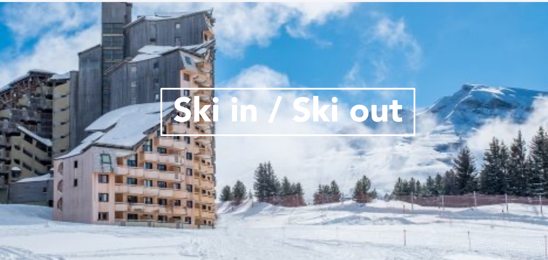
Ski in / Ski out